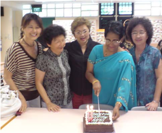
Pioneer members cutting the cake

Happy 40 th anniversary, AHES! The Annual General Meeting (AGM) on 17 th March 2007 at Raffles Girls' Secondary School marked the commemoration of the 40 th anniversary of AHES. Indeed, AHES has come a long way since it started in 1967 by a group of Home Economics teachers.