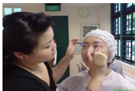
Shiseido's Make-Me Beautiful

After an update of the upcoming events to be conducted 2007, everyone then proceeded to a workshop entitled "Make-Me Beautiful" by Shiseido. All participants were given goodie bags comprising various cosmetics samples. Following the instruction of the beauty consultants, they started applying the cosmetic and violà! Within half an hour, all of them resembled Miss. Universe! Now, with everyone looking stunning - rosy cheeks and big curly eyelashes - it was time to indulge in food! (Continued on next page)